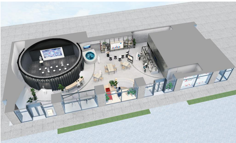
Bird's-eye-view CG image of Mitsubishi Electric's 'East Japan FA Solution Center'

In July 2022, Mitsubishi Electric renewed its 'East Japan FA Solution Center' in Akihabara, Japan following four successful and busy years of operation since its inauguration in 2018. The update will expand the number of solution-based demonstrations and strengthen co-innovation activities to help visitors achieve their manufacturing goals using the latest innovations.