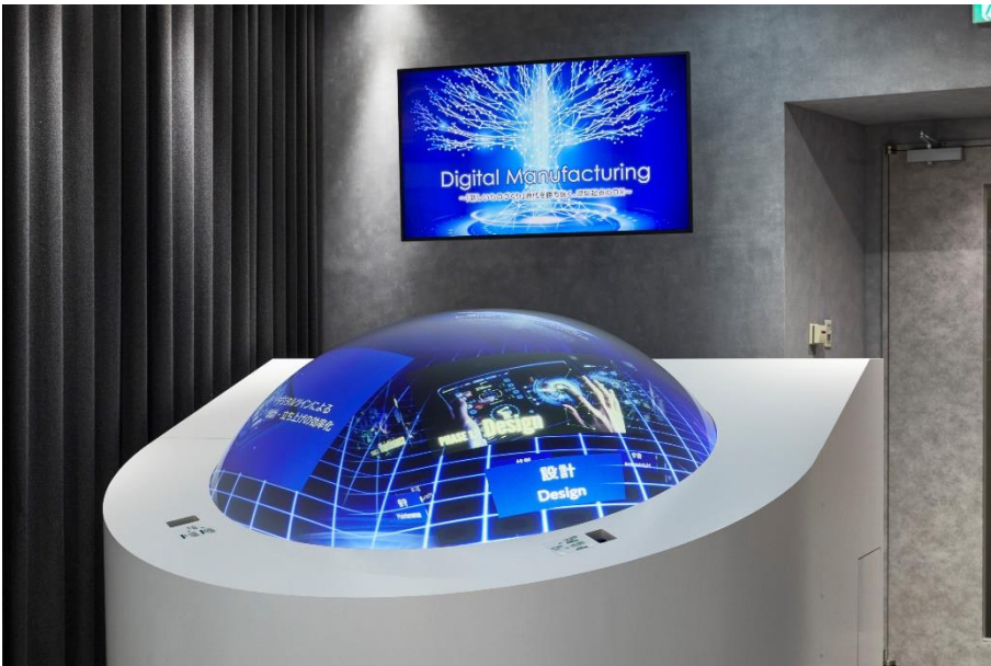
The “Simulation Dome” guides visitors through the equipment design and verification process using a 3D simulator.