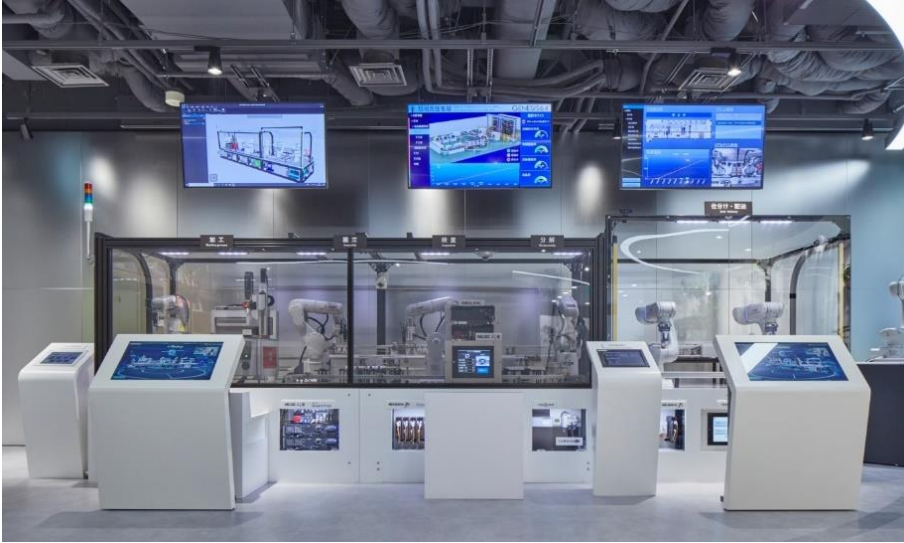
The “Digital Manufacturing Zone” demonstrates the production of smart watches.