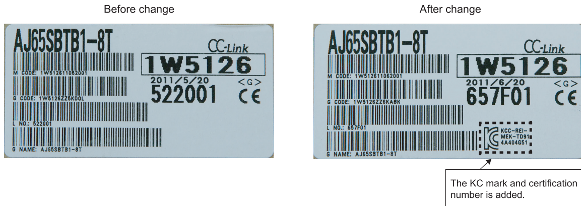
Figure 2 Example of a new package

*: For relevant models, please go to MELFANSweb website: http://www.MitsubishiElectric.co.jp/melfansweb/english/