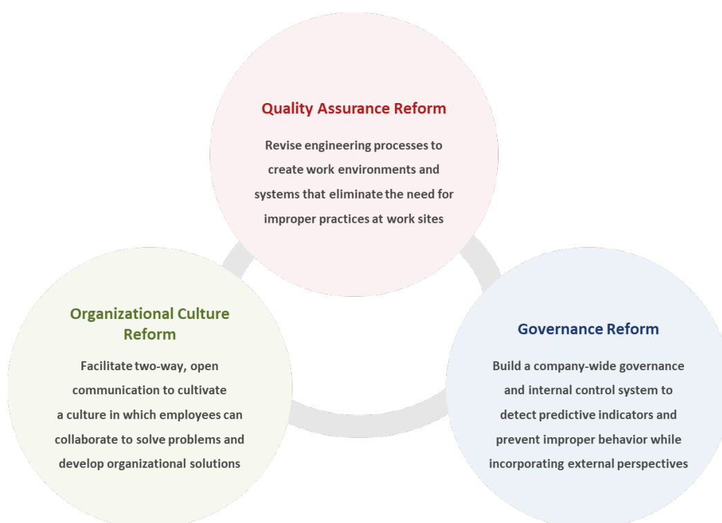
Overview of the Three Key Reforms

In collaboration with the company-wide transformation project, Mitsubishi Electric will make every effort to transform itself towards creating a new Mitsubishi Electric by enhancing and developing the Three Key Reforms of quality assurance, organizational culture, and governance.